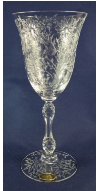
3116 - 10 oz. Goblet, Etched & Cut Wildflower

The pieces that Cambridge both etched and cut are really interesting. Two such designs are Countess and Wildflower. If you're not familiar with them, check them out. Both are extremely hard to find. Wildflower was first etched using an etching plate, ordered in 1937, that was slightly different from the normal Wildflower plate. Then parts of the design were also cut. Very cool effect. Items seen besides #3116 stems are some #3400 pieces, so keep an eye out.