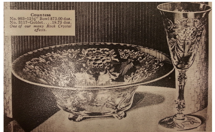
1937 Countess Brochure

Countess is etched Lorna, then parts of the design are also cut. The only reference known is a 1937 promotional brochure. When examining it more closely and comparing it to a traditional Lorna etch, it too looks like a slightly different etching plate was used.