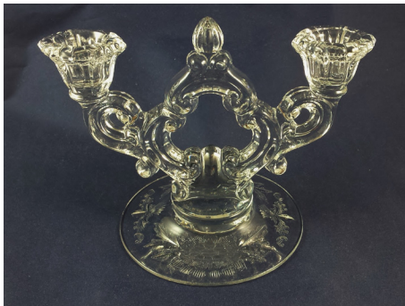
#647 – 6” 2-Lite Candlestick, Countess