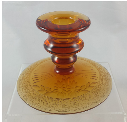
#628 – 3 ½” Amber Candlestick, Etched 703 Florentine, Engraved 4000s