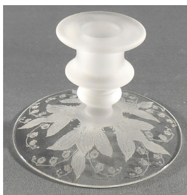
Frosted Lily of the Valley