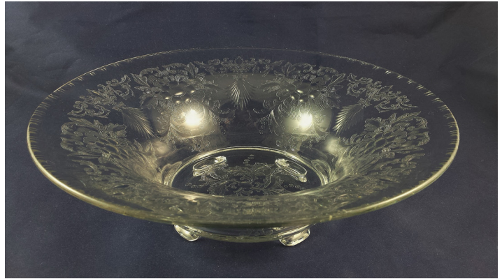
#993 – 12” Bowl, Countess

An interesting discussion ensues when you think about this process. The cutting was polished after it was etched. It would have been difficult to buff out, so was it dipped, and if so, then how did that affect the etching? The pieces definitely have a different feel to them.