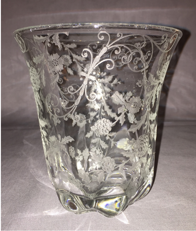
Pristine 572 - 6 in Vase, Elaine