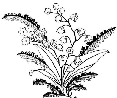
D/1064 Gold Lily of the Valley

You can find items made by the Cambridge Glass Company with several “lily” decorations. How many of these have you seen?