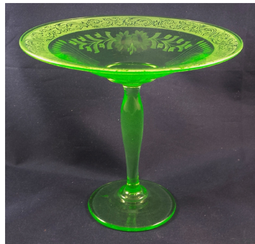
#531 – 7 ½” Light Emerald Comport, Etched 703 Florentine, Engraved 4000s