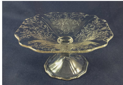
#3400/7 – 5 ½” Comport for Cheese & Cracker, Etched & Cut Wildflower

Here is one additional scenario to show you. These pieces were first etched Florentine, then cut. The cutting was left unpolished, so this process differed from the previous ones. Also, the time frame was earlier, probably in the late 1920s. The cutting is thought to be one of the 4000s, but they are so similar in design, I’m not exactly sure. This combination is shown on the following two examples, and others are known.