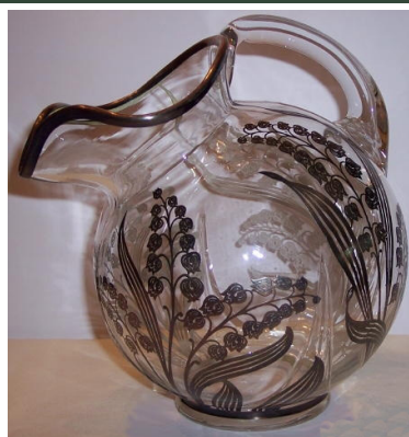
Lily of the Valley decoration by Silver City.