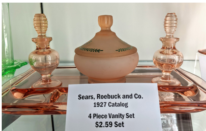
Did you know that Cambridge Glass was sold in Sears, Roebuck and Co. in the early years? Who wouldn’t want this 4 piece Vanity Set for $2.59?