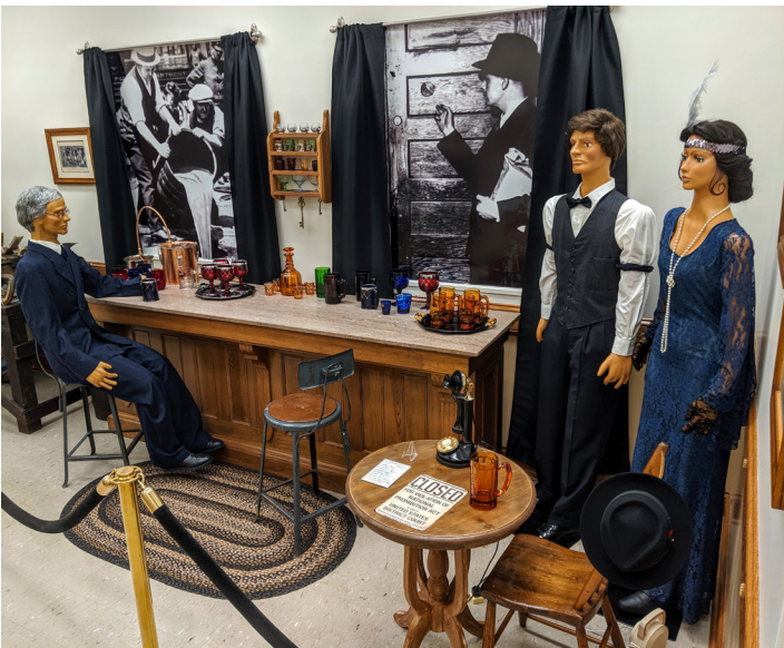
The new Roaring 20s exhibit is ready for visitors. Be sure to visit when you come to the museum. You might even get a sip of Happy Jack, AKA apple juice!