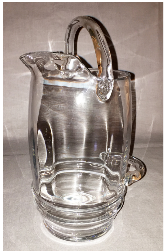
1560 - 80 oz. Ice Lipped Jug, 2 Handles