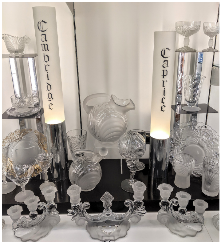
During the museum flood of 1998, the original Caprice display stand was submerged in water. It has been on display at the museum, but needed work to light the Caprice globes. It is now restored, has new LED bulbs and looks wonderful. We are in need of a Crystal Alpine sugar to go with the cream on the top left shelf.