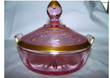
Pink covered butter E520