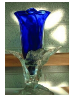
Crystal Everglade candlestick with Royal Blue flower holder