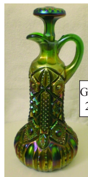
Green carnival treated 2666 32 oz. decanter