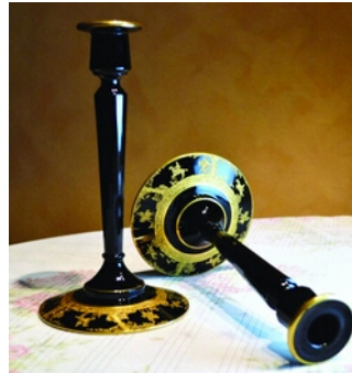
Ebony candlesticks GE Imperial Hunt Scene