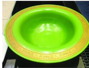
Avocado bowl GE #527