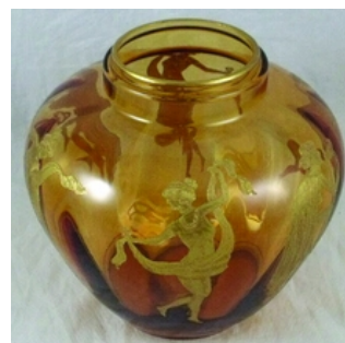
GE Dancing Ladies Temple Jar