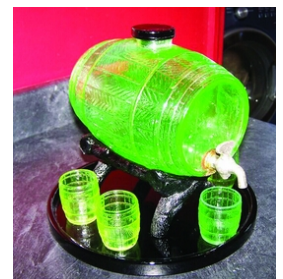
No.1 Keg Set with tray