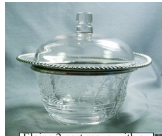
Elaine 2 part mayo with an interesting lid