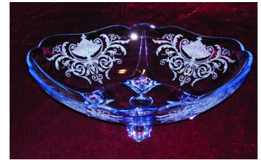
12" Oval Bowl with E739