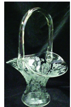
#119 Rose Point basket