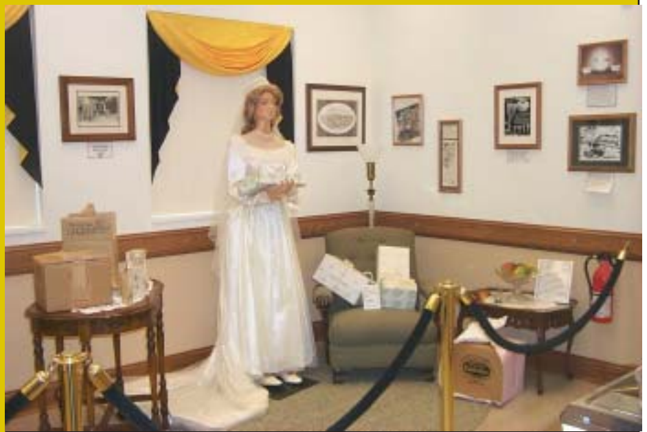
The delightful, new "Cambridge Bride" display, located in the Education Center. The vignette shows a lovely bride unpacking her Cambridge Glass, received as thoughtful wedding gifts. The chair was also manufactured in Cambridge during the same period.

Editor's Note: You may have noticed that this month's issue is only 16 pages, instead of the usual 20. This is an unfortunate reminder of the ongoing shortage of materials for publication. We need research articles, collecting anecdotes, exciting finds... in short, anything of interest to other Cambridge collectors. Please help us out - this is your newsletter. Thank you.