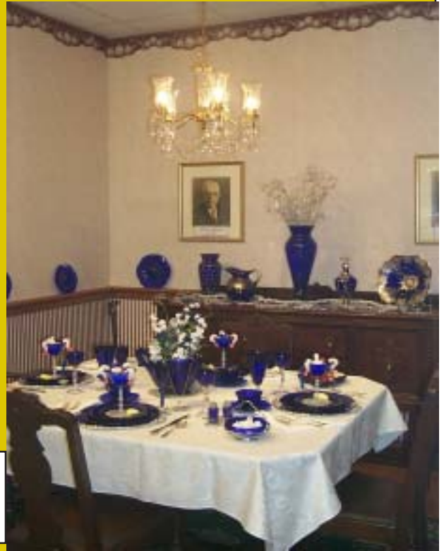
At Right: The 2005 Dining Room Display, including the recently acquired Rosepoint chandelier.