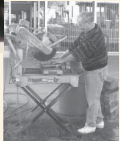
Right: Cutting bricks for the glassmaking display at the museum.