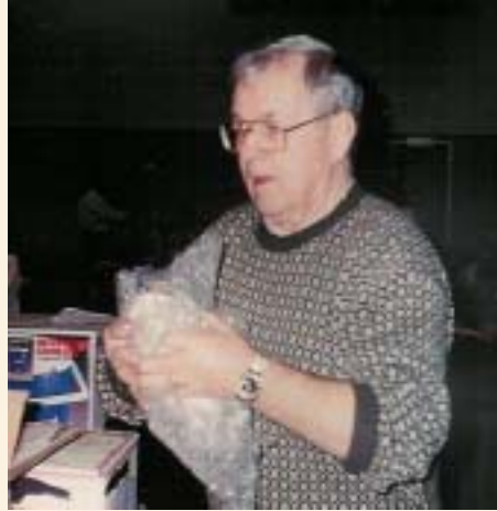
Above: Packing glass at the annual benefit auction.