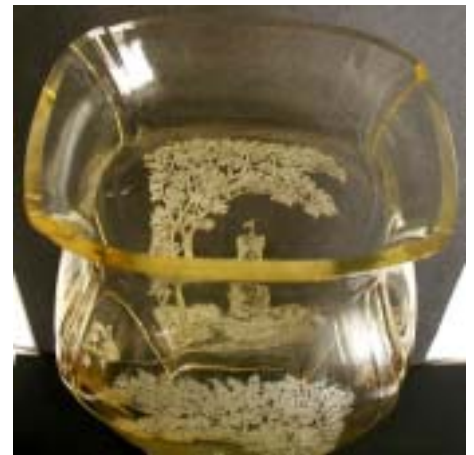
An outstanding Cambridge vase that was submitted to the website for ID; it showed up on ebay a few days later.

Tarzan reports that he gets eight to ten requests in a typical week. Many times, a correspondence develops as pictures and other information go back and forth until the answer is un-