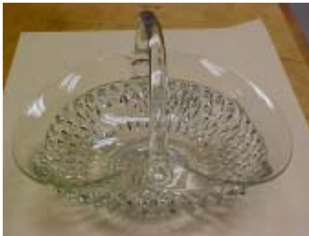
An unusual Mt. Vernon basket submitted for ID