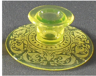
#227 ½ - Flat Foot Candlestick, Topaz, Etched #704