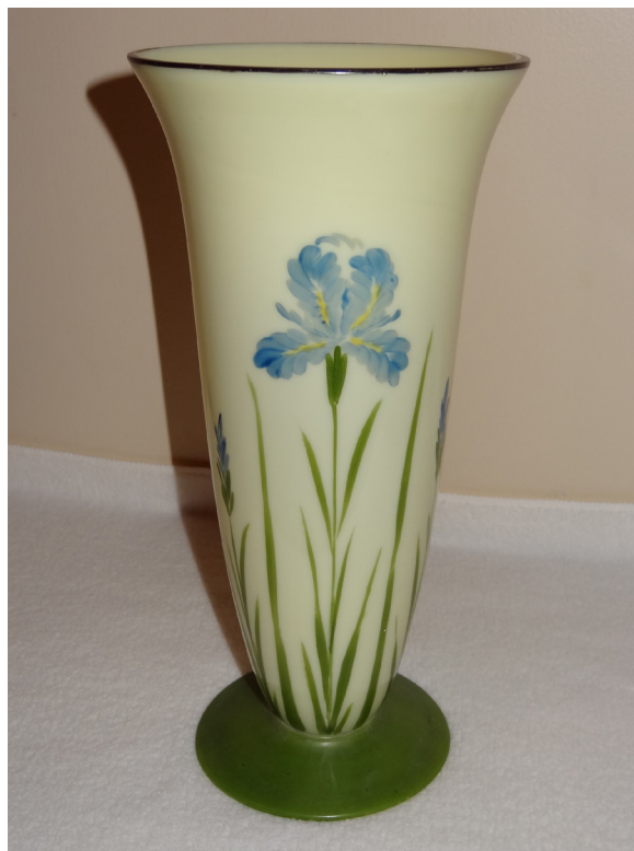
11" #2374 Ivory vase, decorated Blue Iris