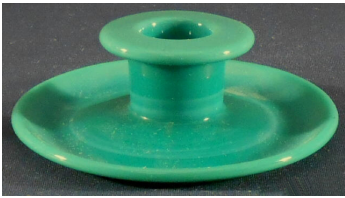
#227 - Cupped Foot Candlestick, Jade

Until next time, share your enjoyment and enthusiasm of Cambridge glass!