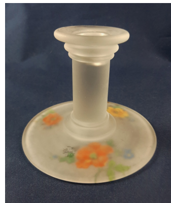
4" Post Candlestick, Decalware Décor

It is known in crystal frosted with Decalware décor, Amber, Light Emerald and Peach-Blo, and etched Cleo, #703 Florentine, #704, #731 and #732. Of course, other colors and decorations of that time are possible. Mvsg.org shows an interesting example in Light Emerald with a cupped foot variation, just like its below cousins. It is curious that 3 of the 5 etches known on this candlestick, #703 Florentine, #731 & #732, were introduced circa 1927, so its lack of a catalog image really is a mystery.