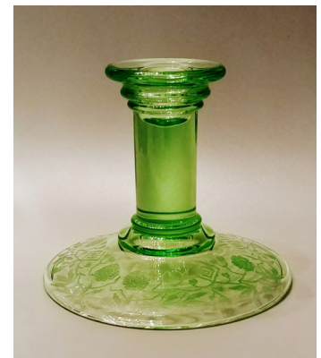
4" Post Candlestick, Light Emerald, Etched #731