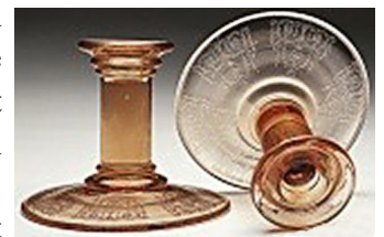
4" Post Candlestick, Amber, Etched Cleo

Let's continue my series on unidentified candlesticks. Another example I think is very cool is what many collectors call the post candlestick. There are many mysteries surrounding this candlestick. It is known to be Cambridge, it's 4 inches tall, but it has no known identifying number. It appears to have been produced some time in the mid to late 1920s because of the known colors and décor. It probably should have been shown in the 1927 catalog. Since it wasn't, it could have been inadvertently left out, or although doubtful, it could have been out of production by this time.