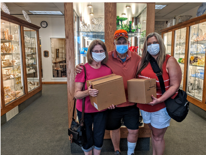
Our first gift shop customers of the 2020 season!

We are very fortunate to have received the OH CARES Grant and will use it wisely to support museum operations. ■