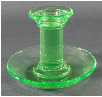
4" Post Cupped Foot Candlestick, Light Emerald

The #227 and #227 ½ candlesticks, many consider cousins to the post candlesticks, show up at the beginning of the 1927 catalog. Maybe if one post candlestick has a number, the other post has the same number with ½, similar to its cousins.