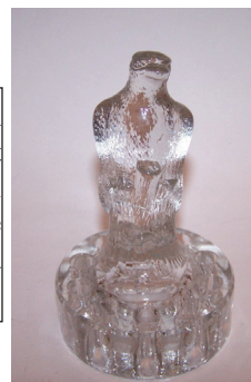
Crystal No. 514 - Eagle flower figure