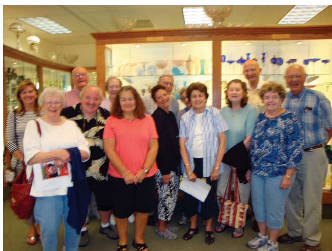
On September 7 th a group from Montgomery Church in Cincinnati, Ohio arrived to tour the museum. They were so interested and involved that they stayed for two hours. What a wonderful group of people!