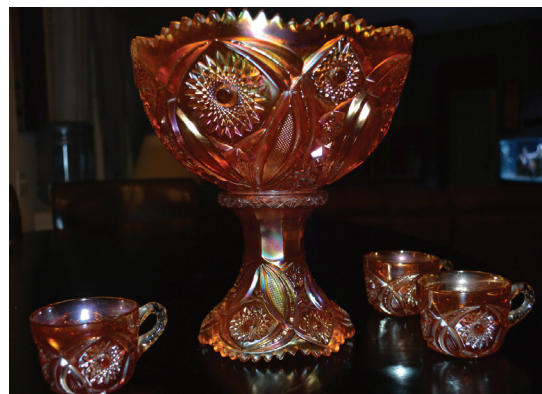
2351 - 10" Punch Bowl and Foot (Marigold Carnival Bowl, with the Carnival Base and three cups)