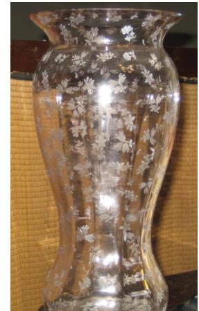
1335 - 12" vase, E758 Chintz (#1)