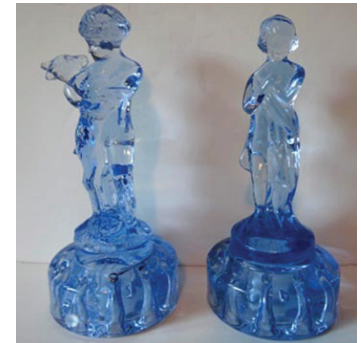
Moonlight Blue; No. 518 - 8½" Draped Lady Flower Holder and a rare No. 509 - 2-kid Flower Holder