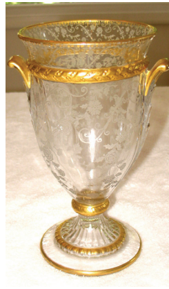
3500/44 - 8" footed vase GE Elaine