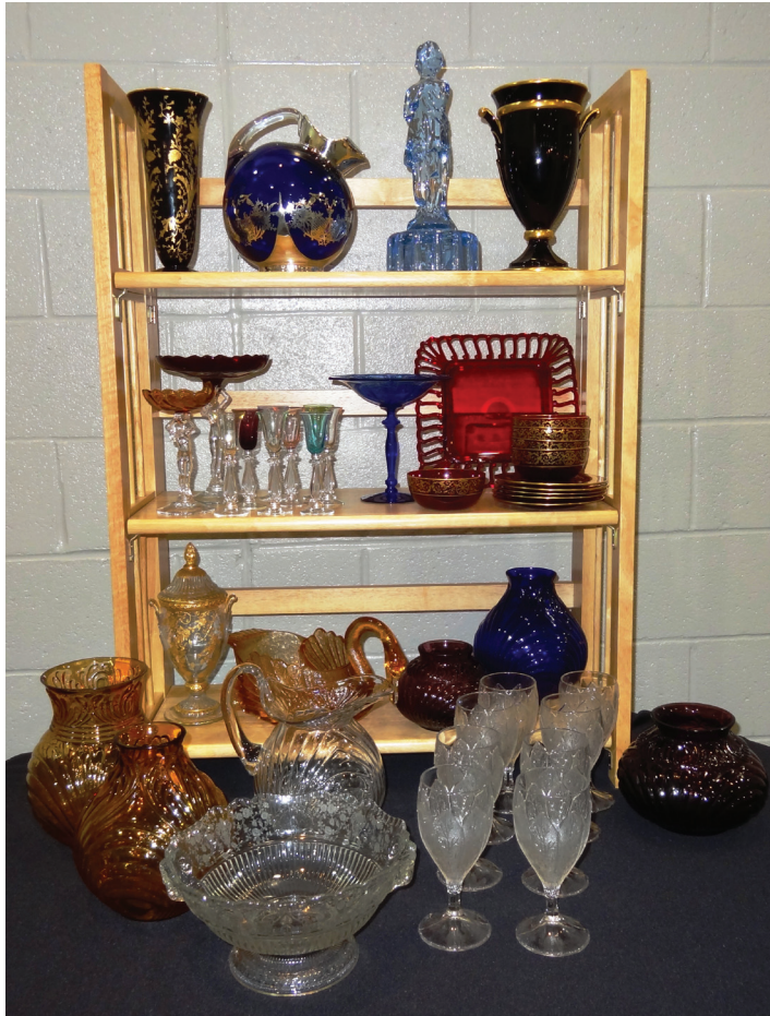
Glass included in the 2013 Museum Forever Raffle.

Please fill out the reservation form on page 5 to join us on November 2 for an enjoyable weekend. The conversations promise to be extraordinary. “Downton Abbey” dinner jackets are entirely optional. See you next month!