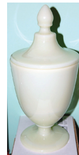
Ivory #96 - ½ pound covered candy