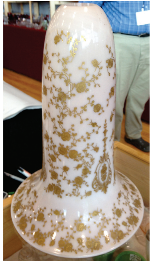
Rose Point piece seen at the 2012 show.