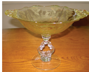
3400/30 - 9½" 2-handle footed bowl (Mandarin Gold bowl, Crystal foot/stem), E 746 Gloria