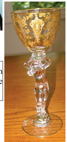
3011/7 claret with ultra-rare GE Rose Point