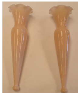
Crown Tuscan 2355 - 8" Cambridge arm vases