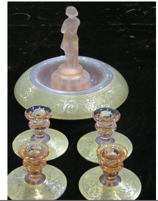
518 – 8-1/2” Draped Lady Figure Flower Holder & 11” Flip Bowl GE #725, with four 628 - 3 1/2” candlesticks also GE #725