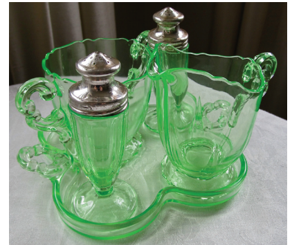
Condiment set with 3400 cream, sugar, S&P with 973 tray