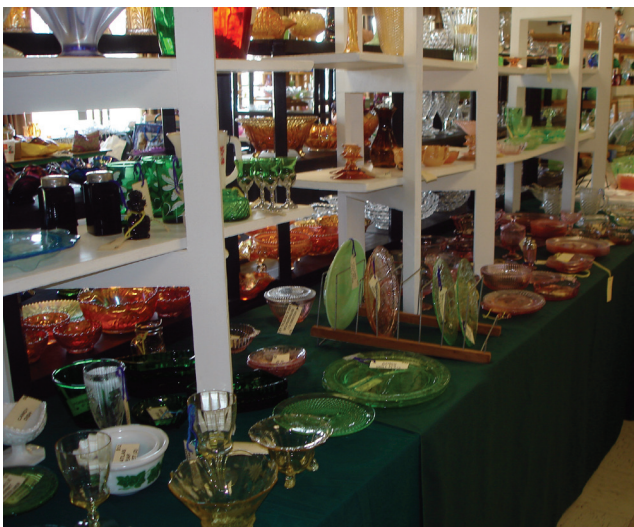
NCC Member J.A. "Oz" Ozvart's booth

The DuVal auditorium has a side wall with floor to ceiling windows which greatly aid in showcasing the glassware. Rosemary and Steve, who have sold at this show for several years, used the natural light to bring out the beauty of their impressive respective inventories of vintage glass ceiling light covers and green Fire-King products. Joe and Holly, dealers from Delaware, placed a #937 Cambridge Glass pitcher and matching tumblers in peach-blo (pink) with etching 695 in their window space, which made the etching's large medallion portion display brilliantly.