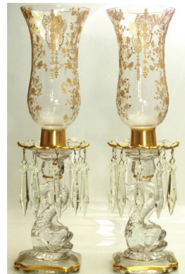
Pair 1612/1614 - 16” Hurricane Lamps with GE Rose Point