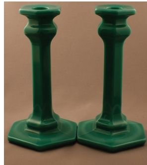
Jade No. 72 - 7” Candlesticks