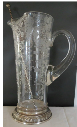
3900/114 - 32 oz. Martini Jug w/Sterling base and stir rod