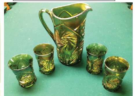
2699/215 (Buzz Saw) – Emerald Carnival Tall Tankard Jug with 4 #2699/415 - Emerald Carnival 8 oz. tumblers