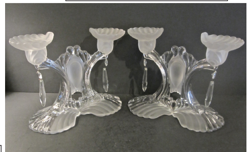
Pair Caprice Alpine #69 (version 1) 7 1/2” 2-lite Candelabrum