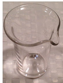
1/2 oz. (15 cc) Graduate, beaker shaped, Standard Apothecaries Measure signed