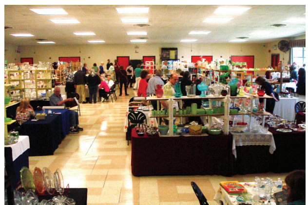
DelMarVa show shoppers

(The writer is a member of both the DelMarVa Depression Glass Club and the National Cambridge Collectors, Inc.)