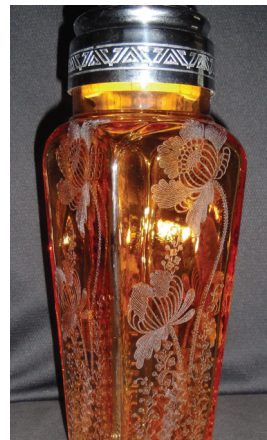
E Gloria 3400/158 - Cocktail Shaker