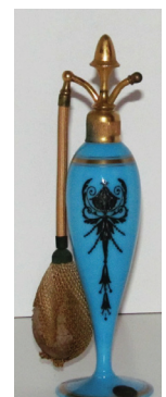
Azurite perfume atomizer w/ Black Enamel #739 etching