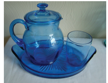
#488 - Ritz Blue 4 piece Night Set