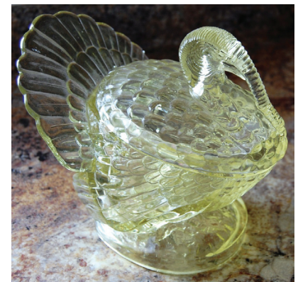
Gold Krystol turkey