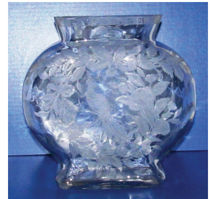
1002 - 1 1/2 Gallon Aquarium, E736