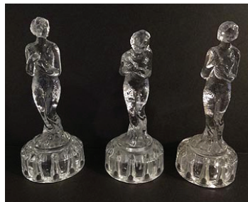
#508 - Crystal 9" Mandolin Lady Figure Flower Holders