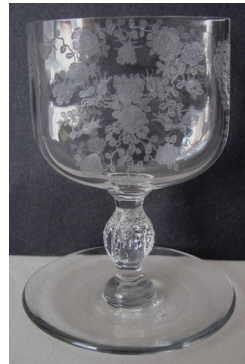
1066 - oval cigarette holder with ash tray foot Rose Point