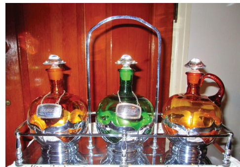
Farber liquor set with three 3400/113 - 38 oz. decanters