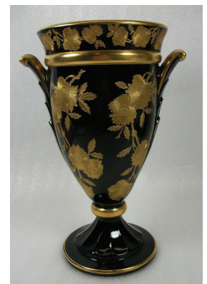
1621 - 10" Footed Urn Vase, D/1059 GE Blossom Time