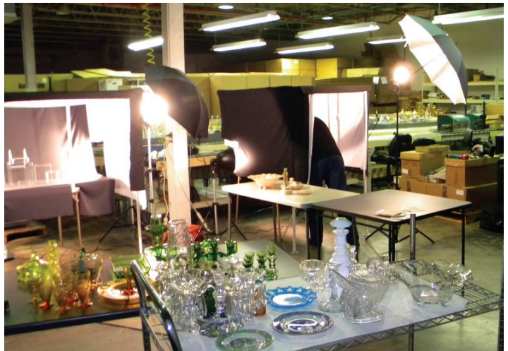
The two photo booths put together by Dave Rankin