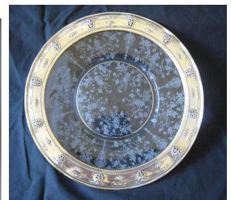
13" plate with pierced Rose Point sterling rim marked Wallace 4607-9