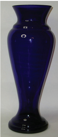
Royal Blue 1336 - 18" Vase