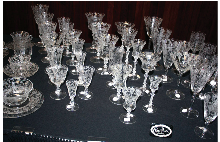
A selection of Rose Point stems on display

If your schedule permits, make plans now to attend next year's November Program and take pleasure in the growing list of additional attractions.