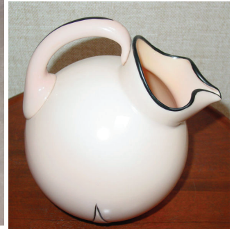
Crown Tuscan with Black Enamel decoration 3400/38 - 80 oz. Ball Jug