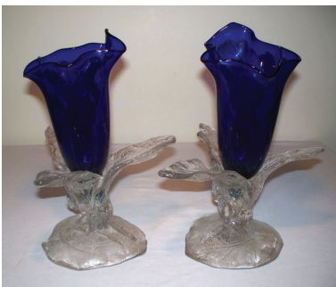
Everglade 5 - 10" 2-piece Flower Holders with Royal Blue vases