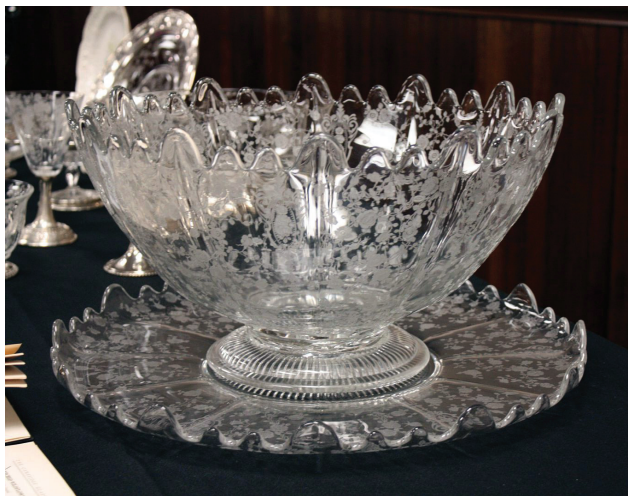
A complete Martha-line punch set etched Rose Point