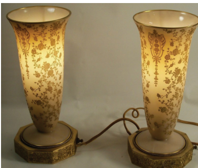
Electric mantle lamps made from Crown Tuscan GE #278 - 11" vases