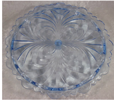
Caprice 31 - 13" Moonlight Blue Cake Salver