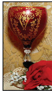
1402/100 - Low Sherbet, GE E752 Diane with a Carmen bowl