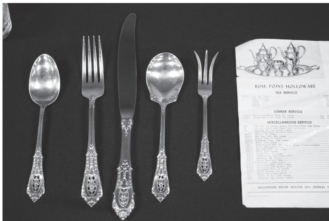
A representation of the Rose Point silverware pattern from Wallace Manufacturing

Following a break to reload the recording equipment, Rose Point items that were fitted with attractive sterling silver rims and bases by the Wallace Manufacturing Company were discussed. Probably the best "Kodak moment" came near the end of the program where examples of Rose Point on vibrant colors – crown tuscan, ebony, carmen, amber and even royal blue - were moved into focus. Much sought after and rarely seen, these items were produced only during the earlier years of Rose Point production.