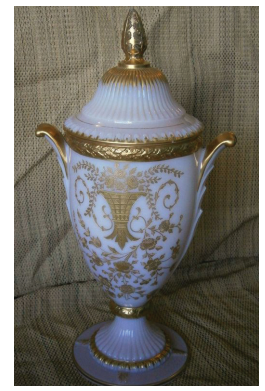
3500/42 - 12" Crown Tuscan Urn, D/1001 GE Portia