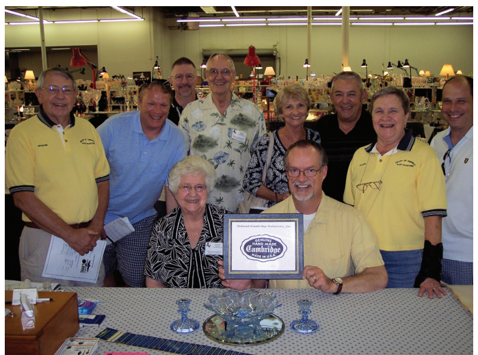
Members of the Heart of America Glass Club show their enthusiasm for Cambridge glass.