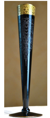
#274 - 10" Ebony bud vase #743 etching