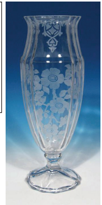
1297 - 11" Vase Appleblossom