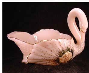
8-1/2" Crown Tuscan swan with Charleton decoration