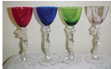
4 #3011 Nude stem clarets