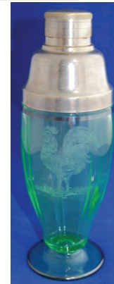
#524 24oz Cocktail Shaker with Rooster etching