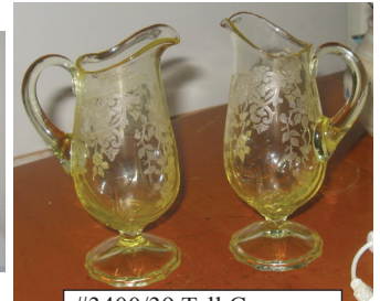
#3400/39 Tall Creamers Appleblossom