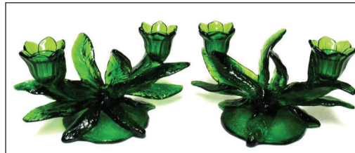
Pair 2-lite Everglade candlesticks