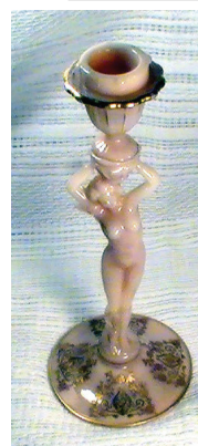
3011/61 9" Crown Tuscan Candlestick GE Diane