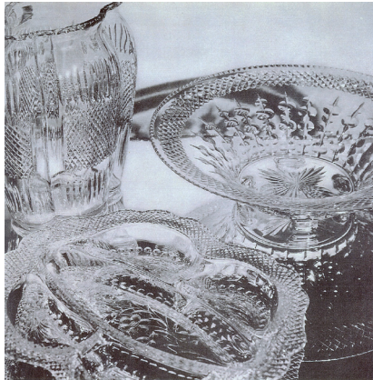
Cambridge Rock Crystal Quality Glassware, unexcelled for shape, design and finish. Available in Complete Lines of Stemware, Tableware and occasional pieces. The Cambridge Glass Company, Cambridge, Ohio