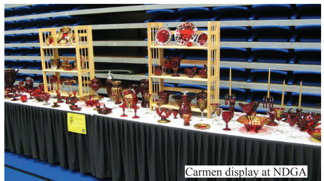
Carmen display at NDGA