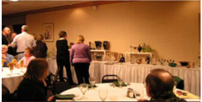
Members admire some of the spectacular overlay pieces on display at the Holiday Inn.