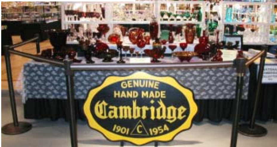
The NCC's Display of Carmen Glass at The Great Northeast Show in White Plains, NY on August 12 and 13. More pictures from White Plains on pages 22-23