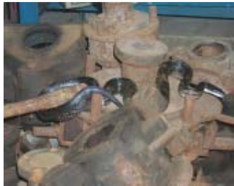
Left: An unwelcome visitor in the Storage Building.

A Dash Through The Past/Museum Student Field Trip Program : We are currently working cooperatively with Mosser Glass, A Taste of Ohio,