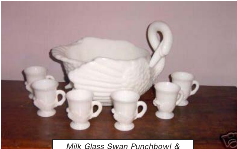
Milk Glass Swan Punchbowl & matching Swan Cups.

The size of Cambridge swans is based on their length, which is measured from the front of the breast ( not the front of the beak) to the back of the tail. Confusion results